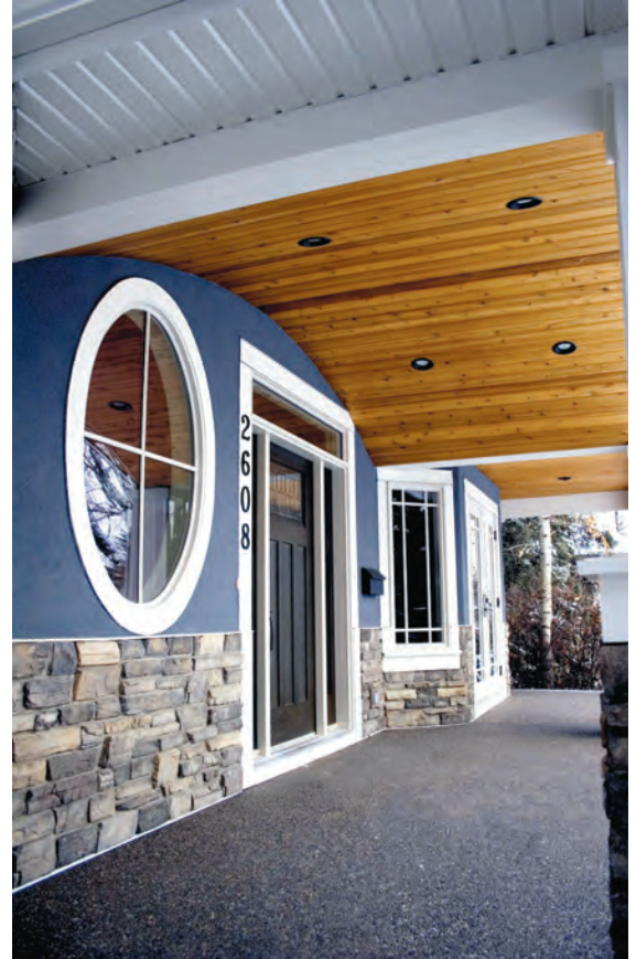
Whenever possible Copper Falls Custom Homes makes use of natural materials such as wood and stone