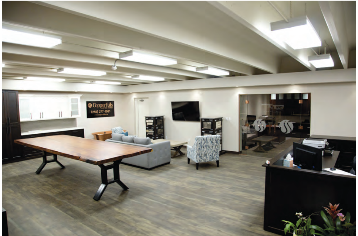
A unique part of the Copper Falls Custom Homes business model is its spacious and convenient showroom

"We use Insulated Concrete Form (ICF) in our foundation which gives you a better R-value in your foundation. We're putting exterior foam on the outside to boost the R-value of our exterior walls. We provide a 50 year