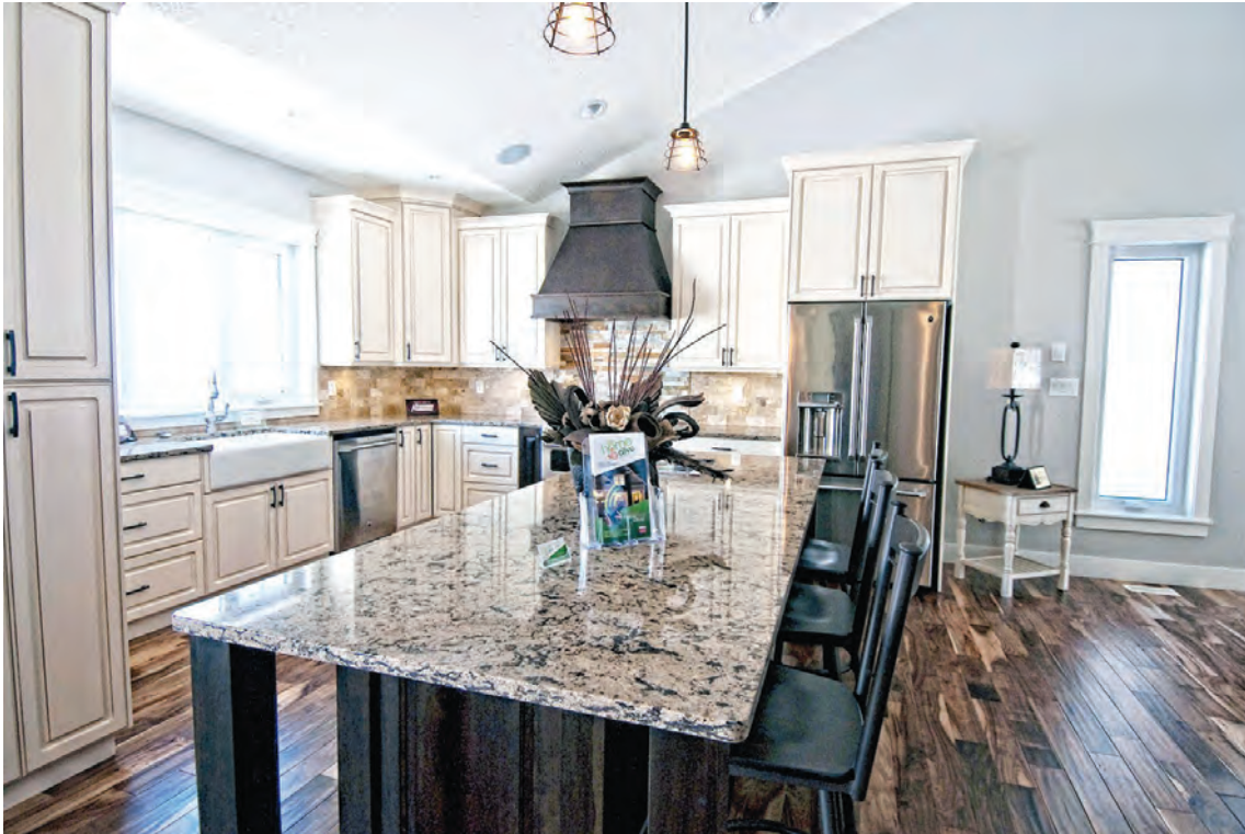
Top quality finishing and plenty of natural light are elements found in a home built by Copper Falls Custom Homes