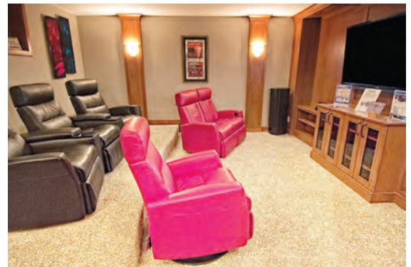
A home theatre room is the sort of extra feature discerning home buyers are increasingly demanding

“That’s a huge goal for us. We want to build something that will last a lifetime. We firmly believe in delivering a home that is designed and built with quality throughout. We want to walk away knowing we’ve done the best we can, knowing there’s quality behind the drywall, a quality that will serve