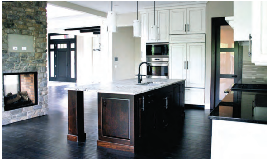
Homes designed and built by Copper Falls Custom Homes are constructed using only the best materials and techniques

"Thanks in large part to the reputation we've developed over the years we were approached by a developer earlier this year, right in the midst of our merger, to be part of a rare opportunity to offer our product and brand to his vision. This will be a gated