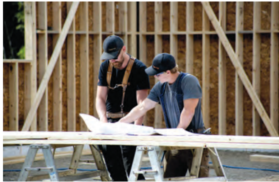
While the company was only formed this year, it represents the merger of two of the area's top custom builders

Over the years both owners have developed relationships with many of the region's top plumbers, electricians, finishers and others, regularly employing them on their projects. But the company definitely tries to handle as many of the duties in-house as it can to ensure a complete continuity in quality