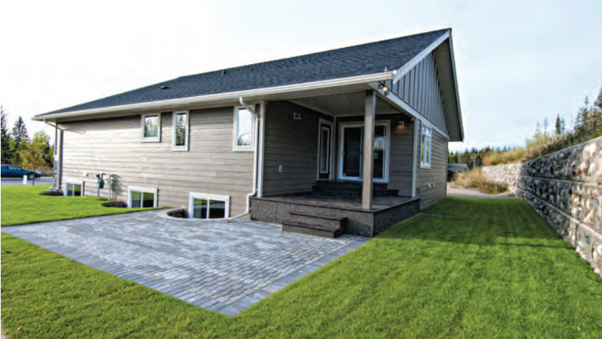
The company can work with any client or budget, from high end residences to entry level family homes

need and can afford. Nice to us doesn't have to be big it just has to be done right."