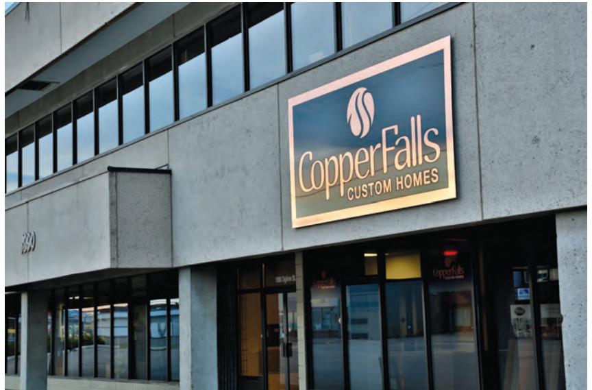
The administrative offices and showroom for Copper Falls Custom Homes are located at 130 – 1990 Ogilvie Street

PROUD TO BE PART OF BUILDING A WINNING TEAM