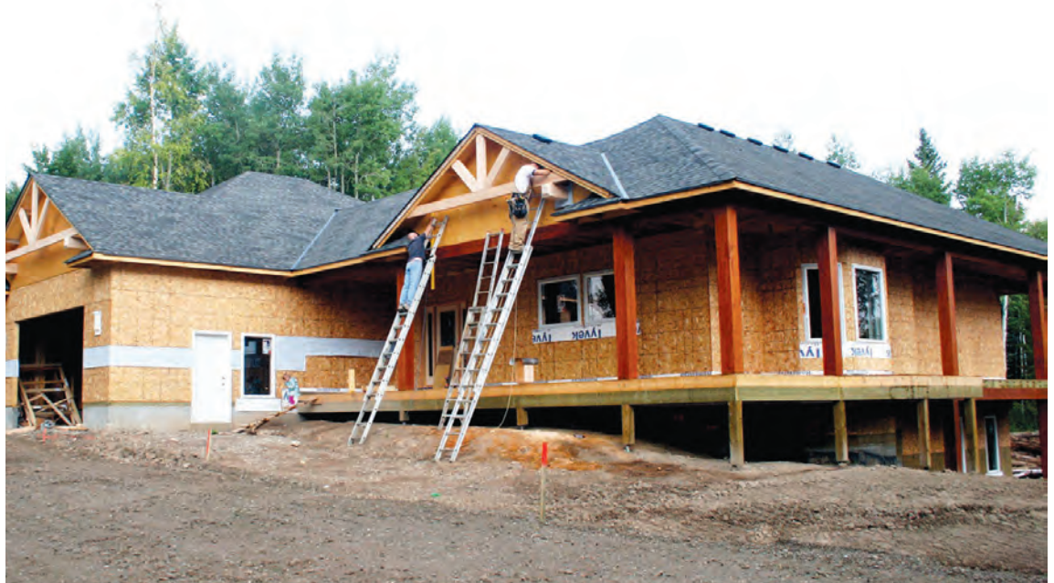
A home designer and a custom builder, Copper Falls Custom Homes works with clients throughout the project

“When I went to Calgary I didn’t intend to go into this field but when I was younger I enjoyed construction and carpentry so when I went to Alberta looking for work the place to be was Calgary, and the thing to do was carpentry as there was so much building going on at the time it just naturally pulled me in and I never looked back. After eight years of living there we decided it was time to move back to Prince