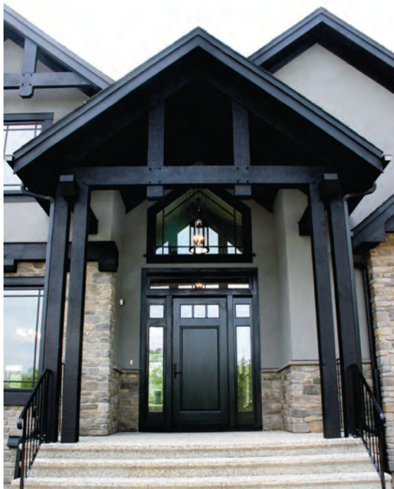
Copper Falls Custom Homes' projects are known for the quality of the workmanship and for the materials used that extra feature discerning home buyers are increasingly demanding